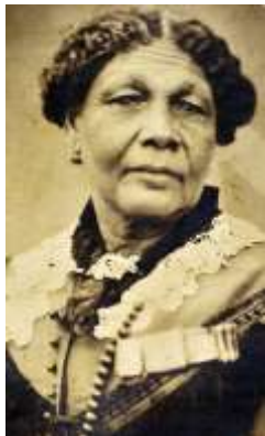
Victorians and their inventions