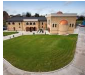
Islam Visit Palmer's Green Mosque