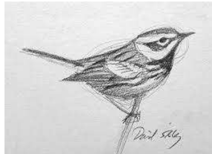
Sketching Artists Are Collectors & Explorers