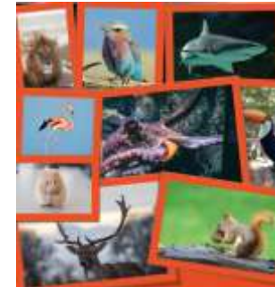
Living things and their habitats